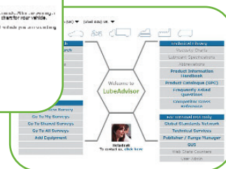
The Shell Lube Advisor website