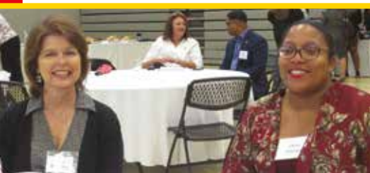
Attending a workforce development program focusing on non-traditional careers for women could be the first step toward a career change.