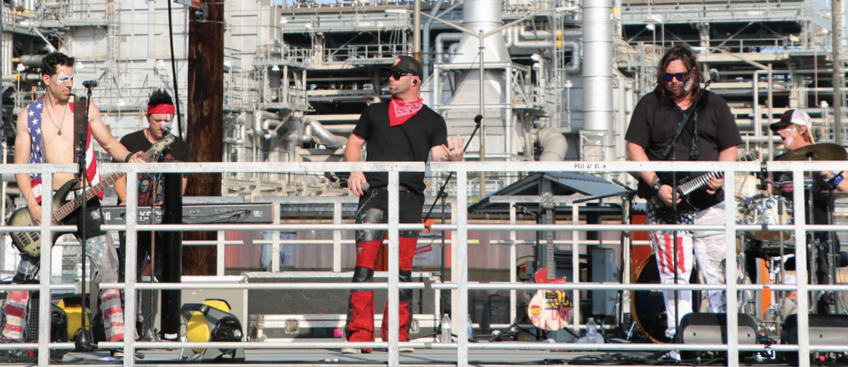
Yes, it's Louisiana's own CHEE WEEZ BAND performing during the Rock Dat Turnaround. The band provided a welcome break and "thank you" for safe work during the mid-point of the recent event. In addition to the rocking sounds, employees and contractors were treated to another Louisiana favorite - Elmer's Chee Wees snacks.