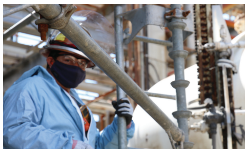
A contractor employee inspects equipment prior to the start of the Rock Dat Turnaround.