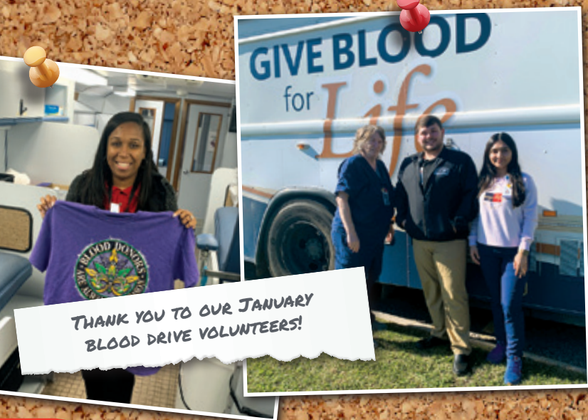
THANK YOU TO OUR JANUARY BLOOD DRIVE VOLUNTEERS!