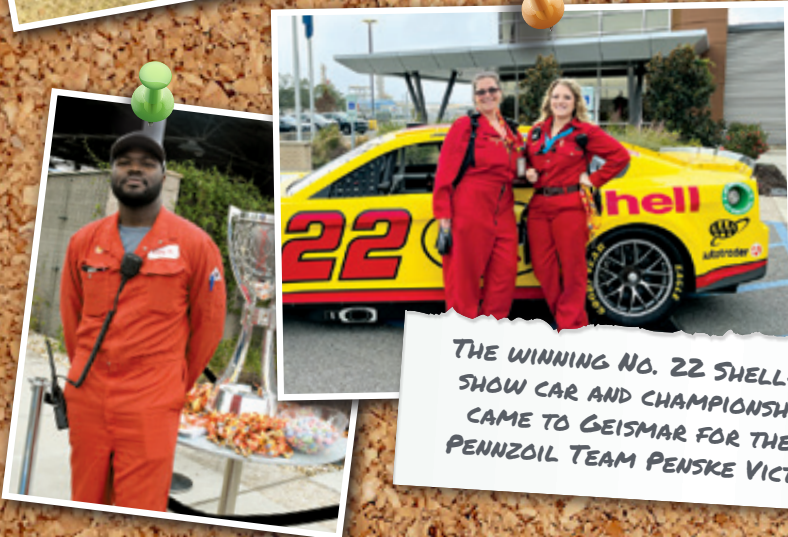
THE WINNING NO. 22 SHELL-PENNZOIL SHOW CAR AND CHAMPIONSHIP TROPHY CAME TO GEISMAR FOR THE SHELL-PENNZOIL TEAM PENSKE VICTORY TOUR