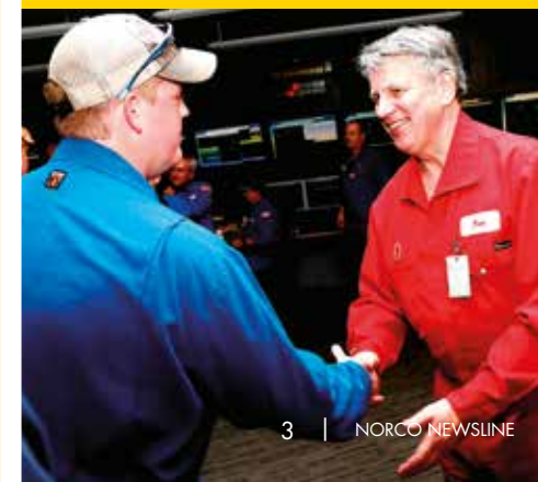
Ben van Beurden greets Shell operators during a visit to the Chemical Control Room.