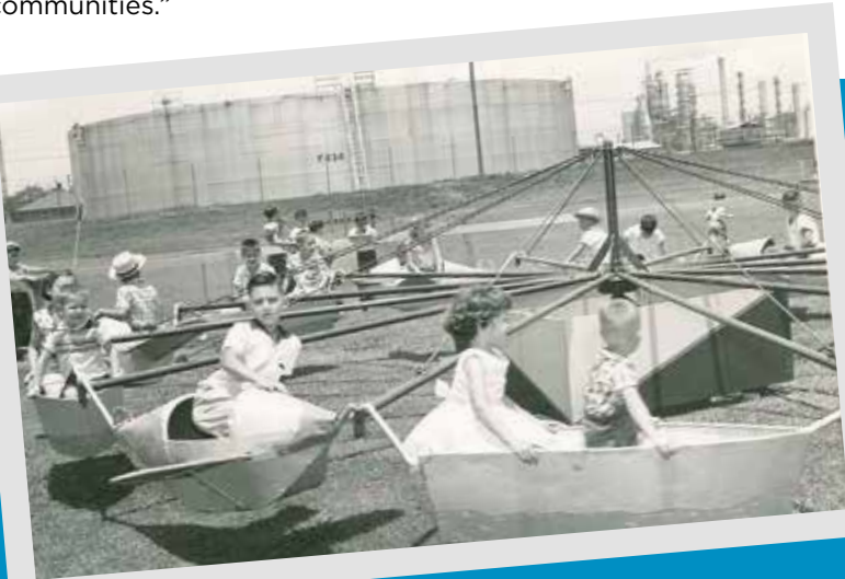
A photo from the Shell Norco scrapbook shows kids having a good time on the site grounds during a summer afternoon.

"You want to do everything you can to keep the site safe so your own kids can work there," he says. "Operating our facility with the Norco community literally along our fence line is something that none of us take lightly. We understand the responsibility we have to the Norco community and I'm proud to work for a company like Shell which has exhibited genuine care and support for its employees and surrounding communities."