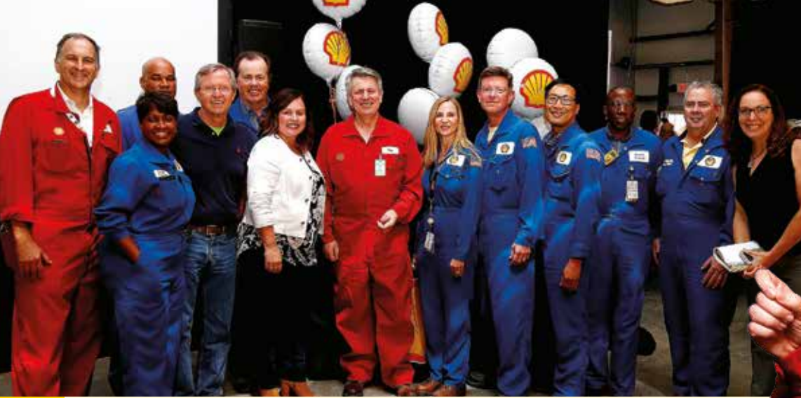
Shell CEO Ben van Beurden , center, receives a warm welcome to Norco and Louisiana from the site's leadership team.