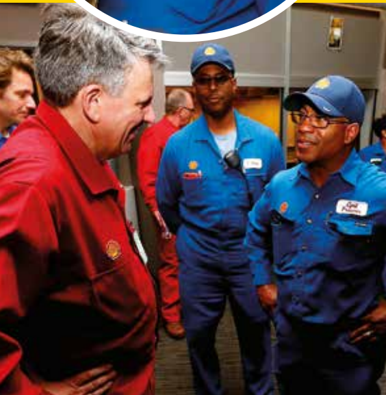
Employees enjoy snowballs and camaraderie and a visit from Shell CEO Ben van Beurden in celebration of Norco's "welcome home" celebration in May.