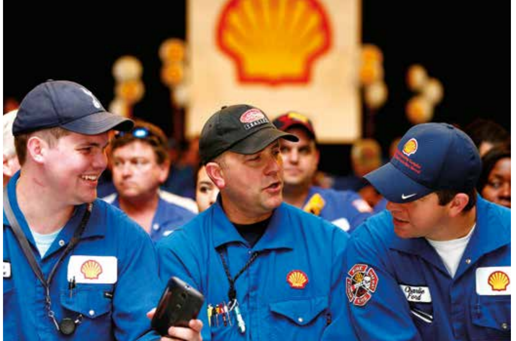
Employees exchange a few thoughts about Norco's return to the Shell family.